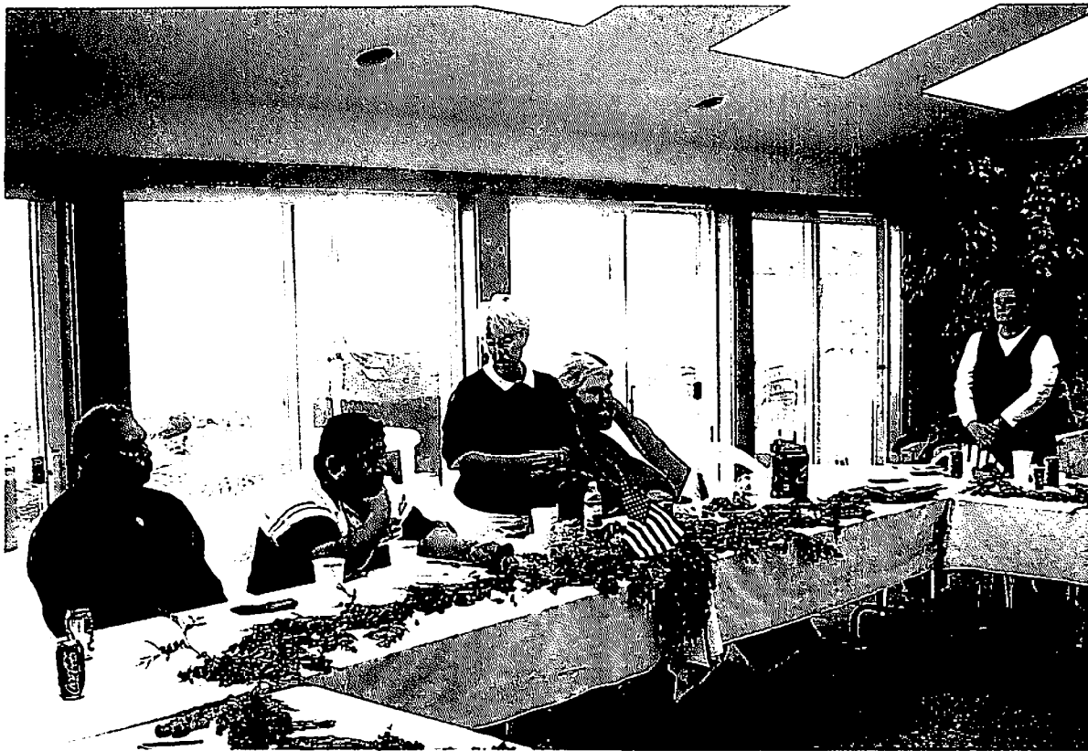
Senator Patty Murray addresses Samish and Quileute Tribal Councils

In this issue: Campaign 2004 is here! Please read our recommendations inside!